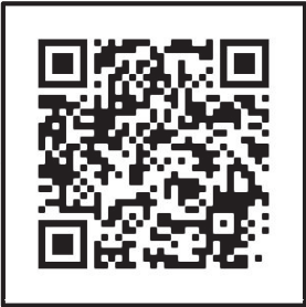
QR scan for BTW